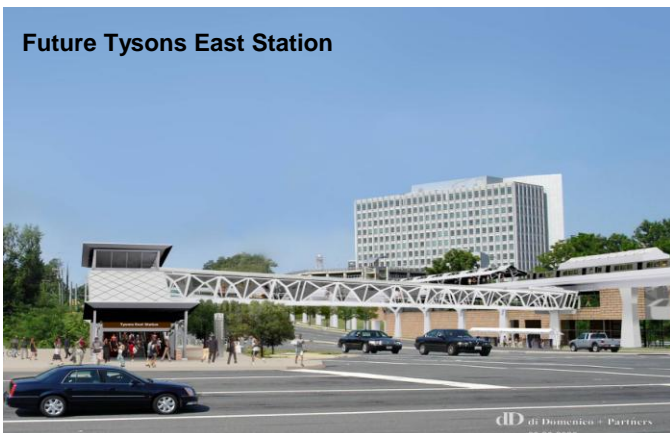
Future Tysons East Station