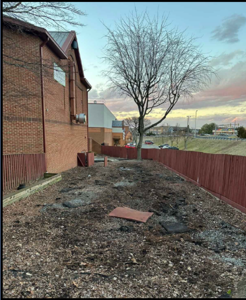
North East Yard