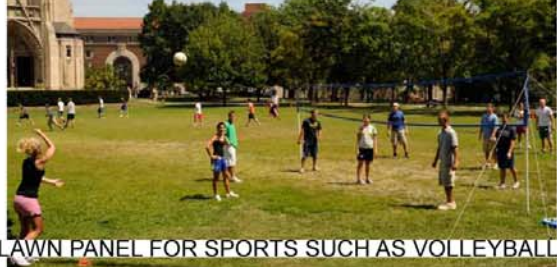
LAWN PANEL FOR SPORTS SUCH AS VOLLEYBALL