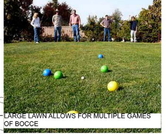
LARGE LAWN ALLOWS FOR MULTIPLE GAMES OF BOCCIE