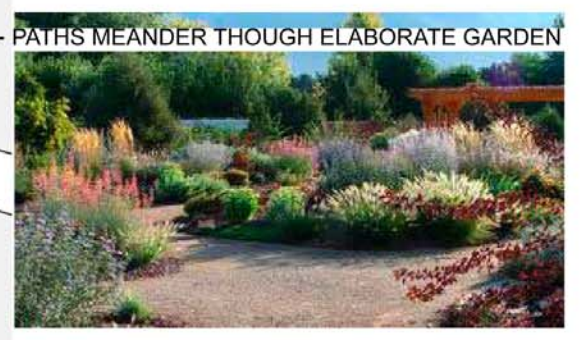
PATHS MEANDER THROUGH ELABORATE GARDEN