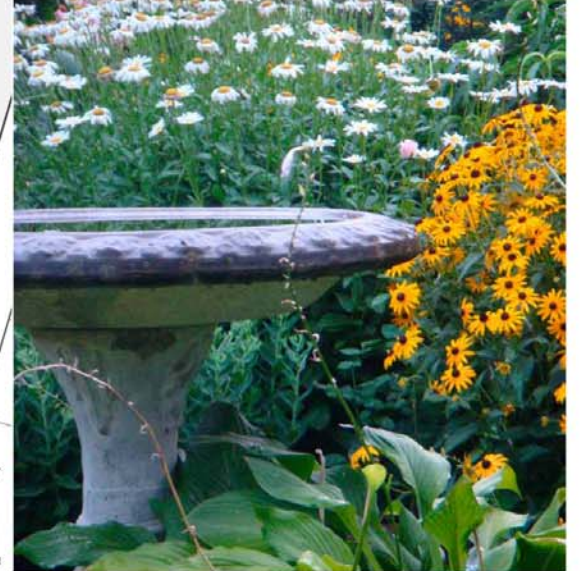
GARDEN ORNAMENTS AND BENCHES SCATTERED THROUGHOUT PLANT BEDS