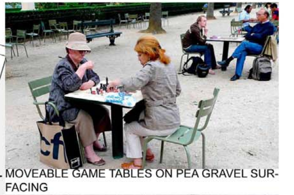
MOVEABLE GAME TABLES ON PEA GRAVEL SURFACING