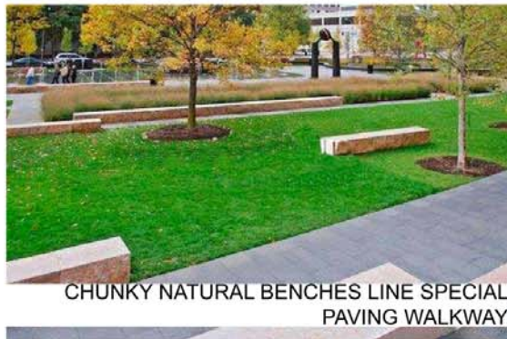
CHUNKY NATURAL BENCHES LINE SPECIAL PAVING WALKWAY