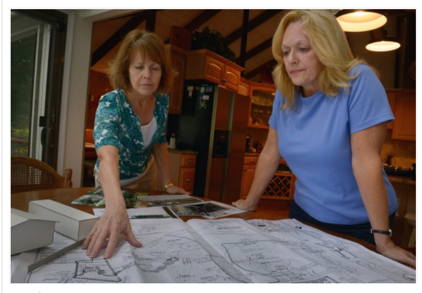
View Photo Gallery — Uproar over Girl Scout warehouse in Oakton: Residents say the proposed 6,000-square-foot facility would be an eyesore, bring more traffic and lower property values.

By Ian Shapira, Published: August 27 E-mail the writer